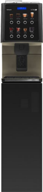
Base cabinet kit For increased autonomy

It offers a pleasurable experience with an attractive, simple and functional design.