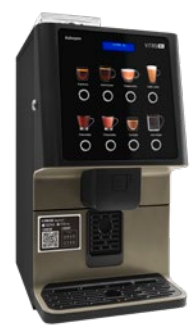
Isypad mobile app for Vitro S1 Just Scan the QR Code and make your coffee drink selection from your phone