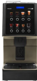
Plinth - Optional Waste drawer increases capacity by up to 130 cakes (based on brewer) and 1 gal / 4 L. Front removal. Rises 5.9" / 150 mm.