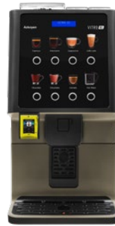
MDB Cashless module kit - Optional Ready to install a cashless system