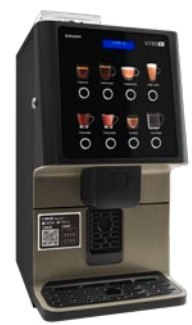
Isypad mobile app for Vitro S1 Just Scan the QR Code and make your coffee drink selection from your phone