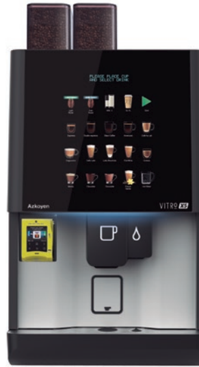
Cashless system integration option