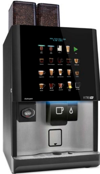
Cashless system integration option

For a self-contained operation, the Vitro X5 allows you to integrate a cashless system.